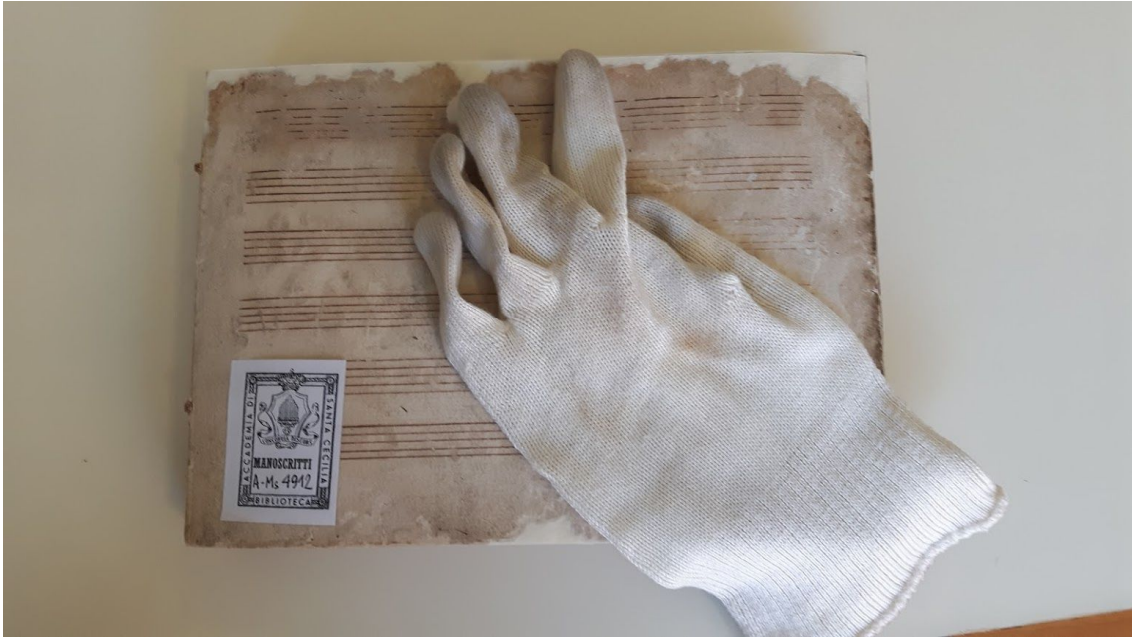
I-Rama-A-Ms. 4912. The new 'paper', added at the restoration, can be seen at the top and the bottom.