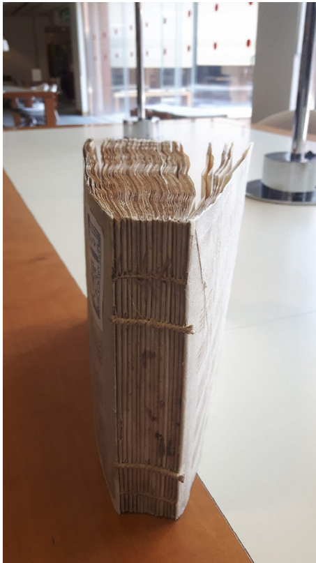
Manuscript I-Rama-A-Ms. 4912.